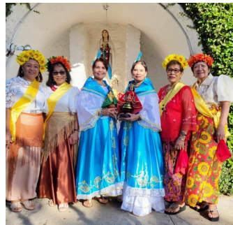
Pictured to the left are some of the ladies who processed in at the 9:30 a.m. Mass to celebrate the Feast of Santo Nino.