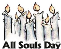
All Souls Day

held next Sunday, October 29 th , after the 5:00 p.m. Mass . Gathering will begin with a rosary in front of Mamma Mary's grotto. A barbecue potluck will follow under the tent. If you need more info, please contact the parish office. We hope to see you all there!